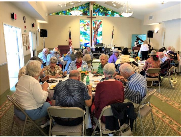
First, we ate.