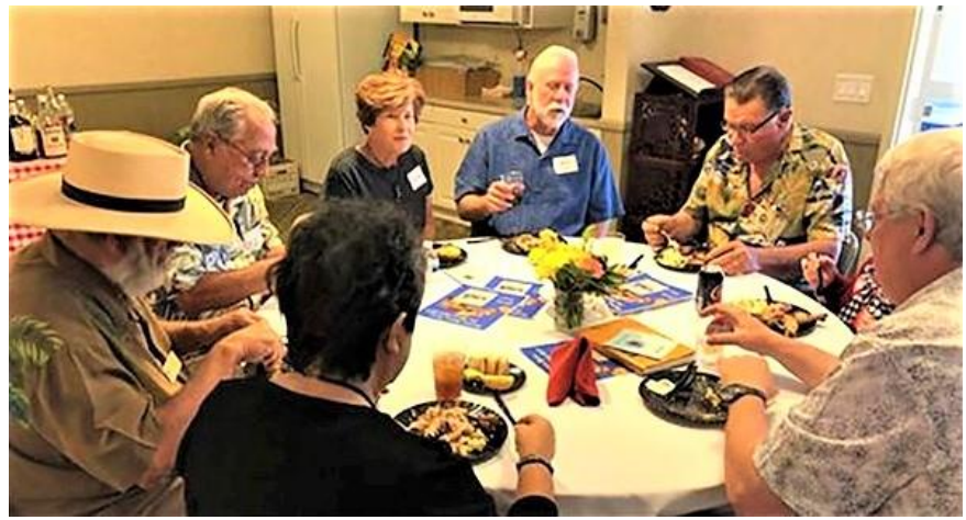
Then, we talked.