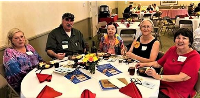
Then, we smiled for the camera.