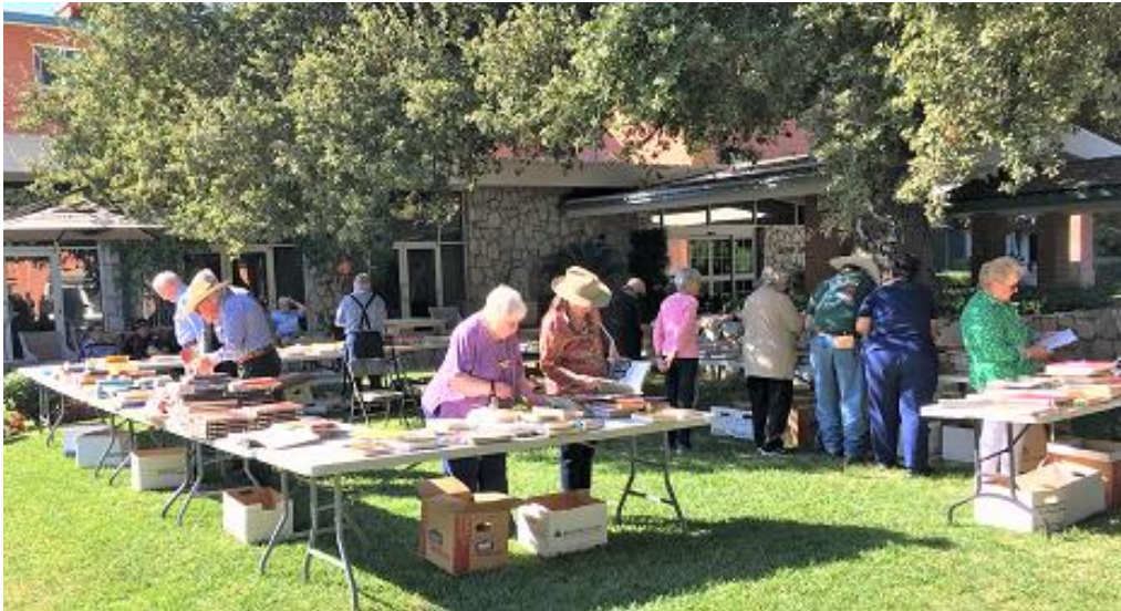
And, of course, the book and art sale at Brian Dillon's Oak Tree Marketplace was another major feature of the Rendezvous!